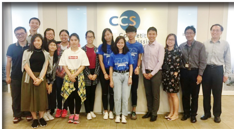
三支勝出隊伍拜訪新加坡競爭委員會

As part of the Grand Award, the three winning teams have enjoyed a fruitful and meaningful 3-day study tour to Singapore where they visited the local competition authority and academics to learn about how competition law works in another jurisdiction. Another six outstanding teams and nine finalists were also awarded for their excellent works. The judging panel comprising experts and professionals with competition law, education, creative and media background was profoundly impressed by the high standard of creativity, technical skills and clear comprehension of the Ordinance the young participants have demonstrated.