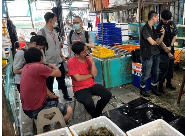
The Competition Commission searched a number of premises in the Aberdeen Wholesale Fish Market with the assistance of the Police.